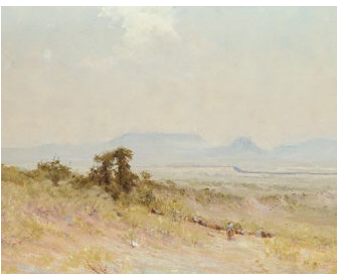
c1920 painting of House Mountain (in background) by Frank Reaugh.

Our Saturday May 17 field trip will take us to House Mountain, located on a private ranch in western Llano County. The mesa-like ridge rises over 500 feet above the surrounding terrain. We will drive to the summit where prehistoric lookout sites might be found (a type of site not generally recognized in central Texas). According to Indian captive Herman Lehmann, the ridge was used as such a lookout in the 1800s by raiding Apaches.