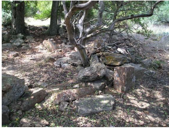
Stagecoach station - rocks perhaps part of living quarters within a huge stone corral. On the "upper road" between San Antonio and El Paso in use between 1868 until around 1880.