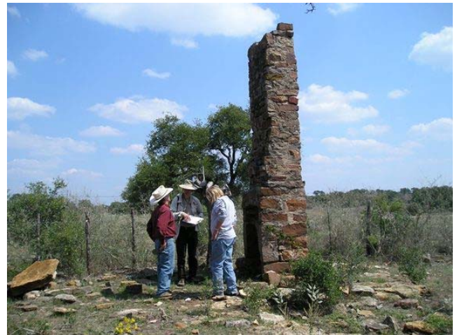
Group standing around chimney at first homestead we visited. This one seems to be the oldest of the four homesteads we saw - mostly aqua and black glass, no well or cistern but creek very close by.