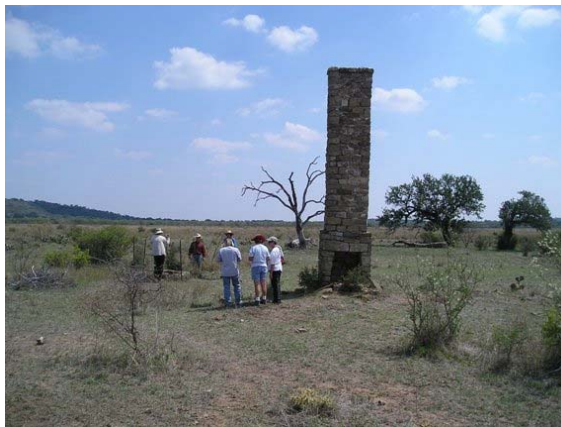
Chimney at third homestead site we visited - lots of purple glass around so it was in use around turn of 20th century. Large rock-lined well nearby.