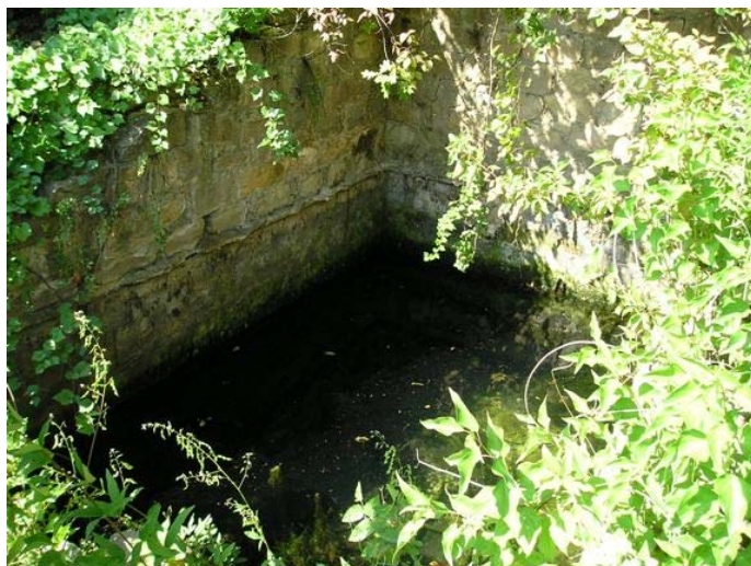
Old masonry reservoir at spring on side of ridge. Constructed well before the 1880s when land was bought by Rimmer's great grandfather.

We were shocked to learn that our gracious host, Col. Rimmer Fowler died unexpectedly only a few days after our visit. Our condolences to the family.