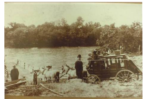
Stagecoach crossing near the old town of Bluffton

chanan area. Topics such as the old Saltworks operated by the Cowan family, early communities including Bluffton and Tow, and colorful characters such as Oscar (Ok) Chestnut will be included. He will also discuss the construction of Buchanan Dam and the impact it had on the people who lived in the lake area.