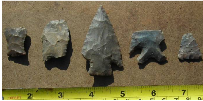
Artifacts from 41BT407

A number of projectile points were found on the surface, most by Pat and Chelsea. The stylistic types include (in chronological order) Angostura, Martindale, Peder-nales, Castroville, Darl, and Perdiz. Cross-dating these styles with similar