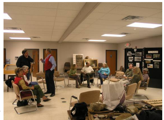
LUAS members visit at the December Holiday Party

As always, comments, corrections, suggestions and contributions are welcomed for both the newsletter and the website.