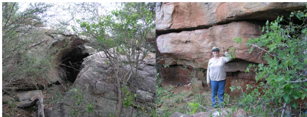
One of shelters on House Mountain.