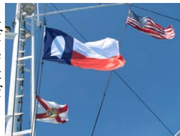
Gault flag at sea on the RV Suncoaster - owned by the Florida Institute of Oceanography