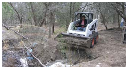
Backfilling looted block.

Many thanks to the LUAS members that came to help close out the Bowmer Project. We were able to fully stabilize the site and do some last minute testing that added valuable information.