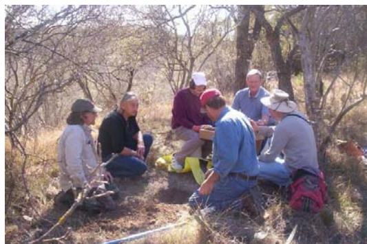
LUAS Members test river terrace.