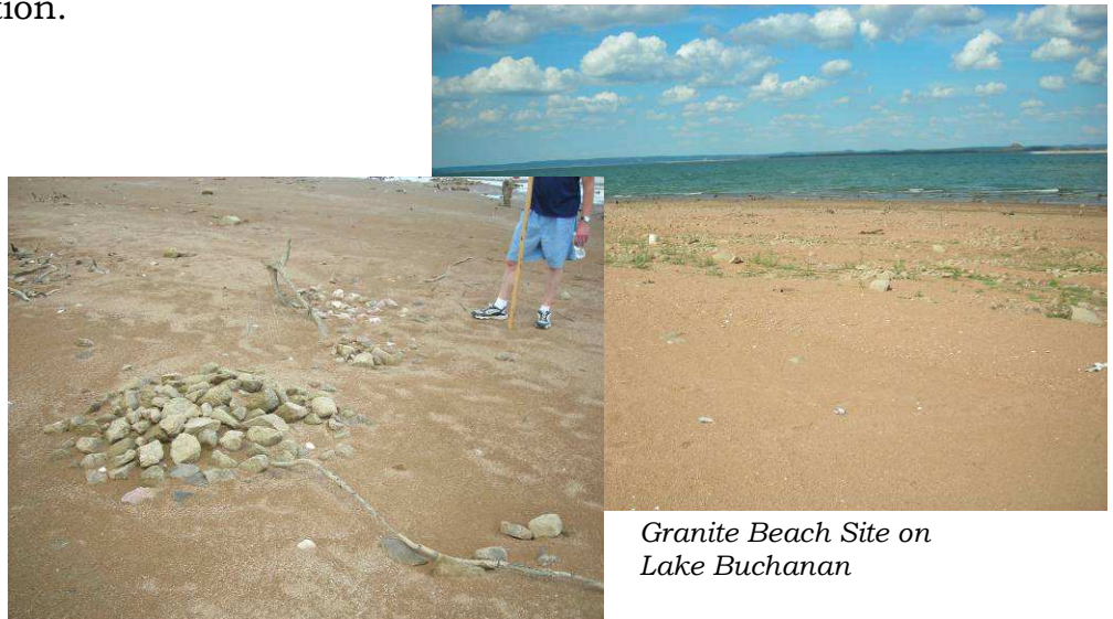
Granite Beach Site on Lake Buchanan

The details as to time and rendezvous location will be decided on at the September 9 meeting. Or Contact Chuck Hixson (325-423-0379, charles.hixson@gmail.com ) for more information.