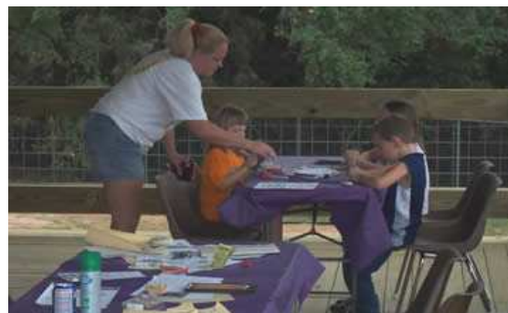
Pebble painting at the 2004 Archeology Fair