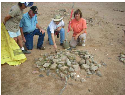
Now that's a hearth!