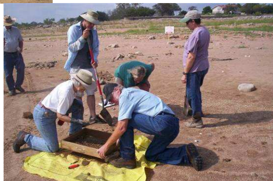
And more testing