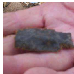
Darl point (or is it?..)