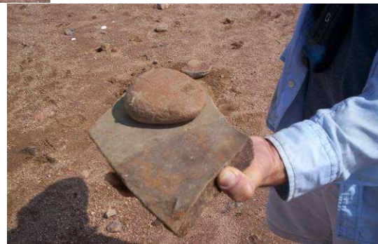
A metate and a mano